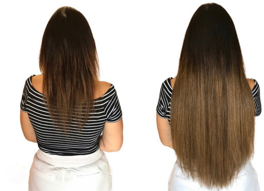
THIS IS WHAT 150 GRAMS OF HAIR EXTENSIONS LOOKS LIKE ON MEDUIM HAIR