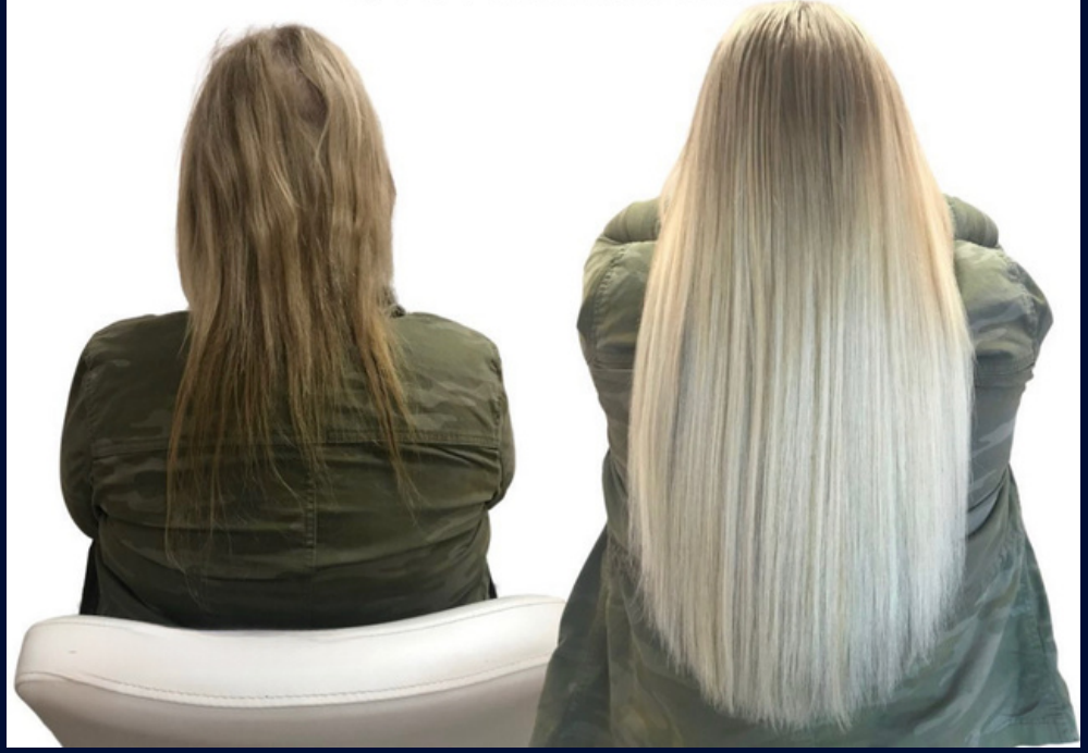
THIS IS WHAT 125 GRAMS OF HAIR EXTENSIONS LOOKS LIKE ON FINE HAIR