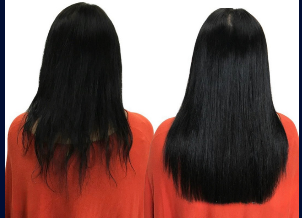
THIS IS WHAT 75 GRAMS OF HAIR EXTENSIONS LOOKS LIKE