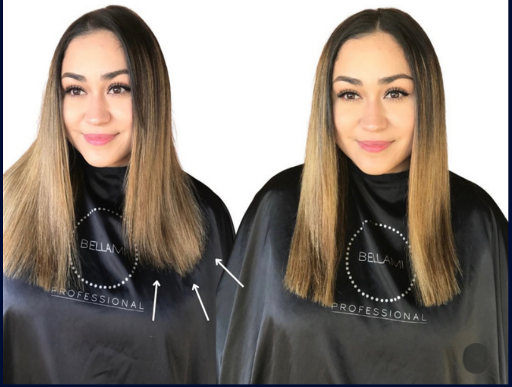
THIS IS WHAT 25 GRAMS OF HAIR EXTENSIONS CAN DO