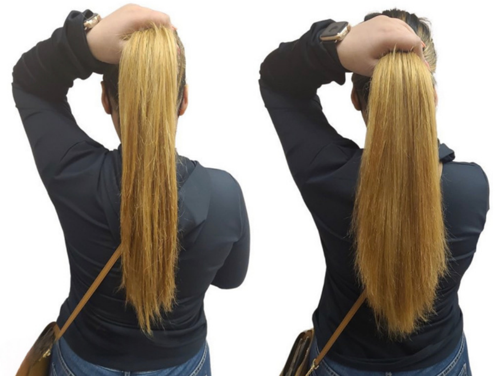
THIS IS WHAT 50 GRAMS OF HAIR EXTENSIONS LOOKS LIKE